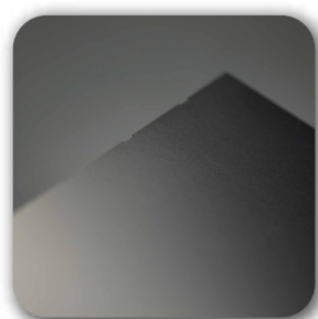
— PCB Material —