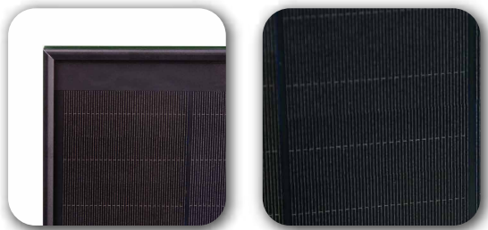
— Product details —