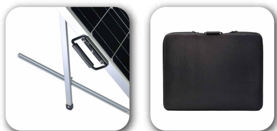
— product details —