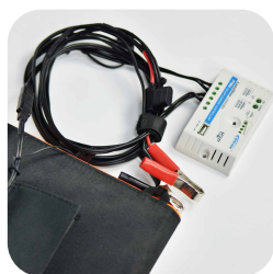
— Product details —